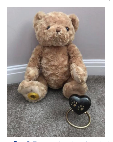
▶ Figure 3. The keepsakes where the author's pet ashes are kept.

At the author's practice, an electric candle is used and is lit when euthanasia is taking